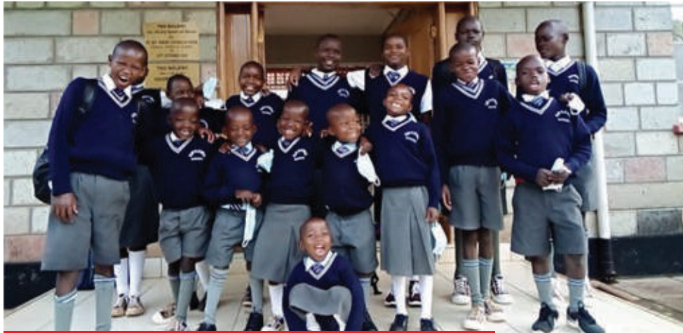
Bright smiles before a 1km walk to school!

Kip Keino School plans to expand to include a Junior Secondary School.