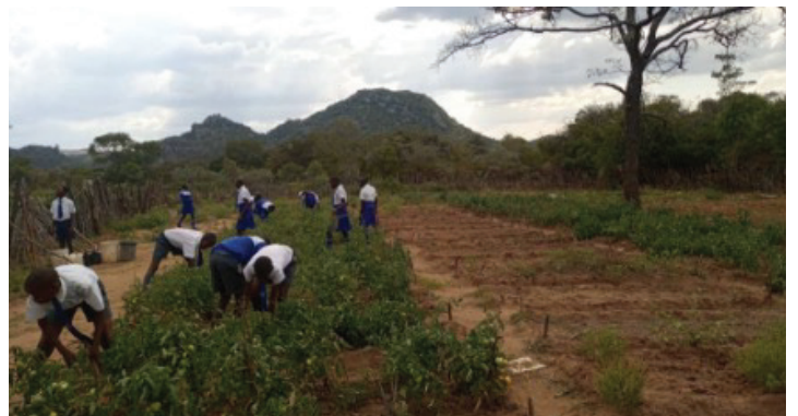
Our ECD school doing great. They normally get 2 meals a day