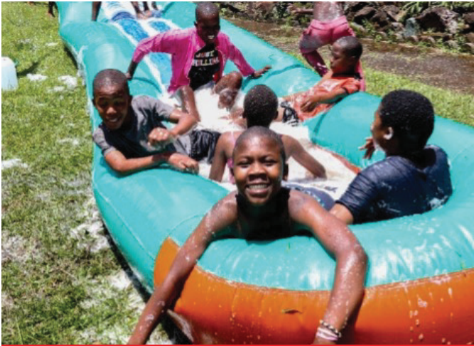
Holiday Smiles made unforgettable with jumping castle fun!

For many, it was their first time experiencing a movie, making the outing even more memorable. GTO, your thoughtful gestures, both big and small, mean the world to us. Thank you for always considering the well-being and happiness of the children. Your kindness has brought countless smiles to their faces – thank you!