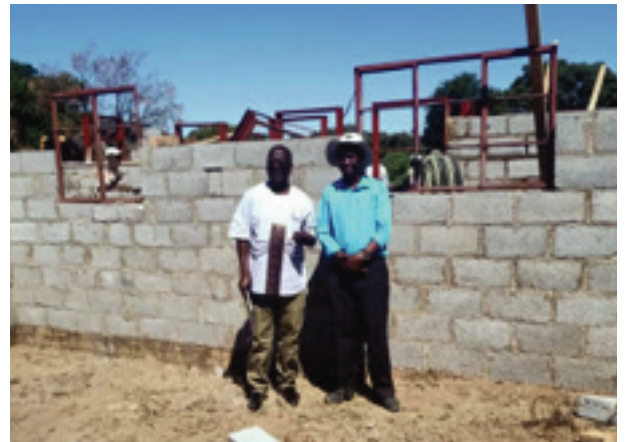
The construction progress on the additional buildings.