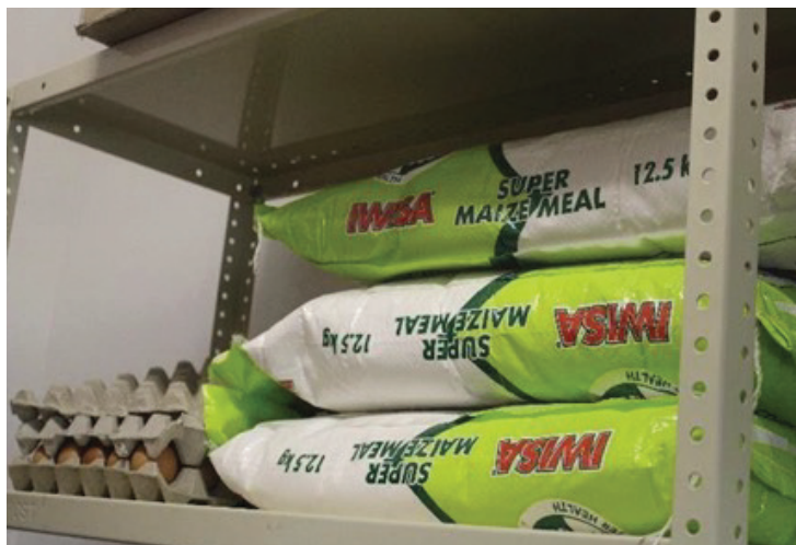
Food items ready for the school menu, thanks to GTO's generous contribution.

Organisations such as GTO Trust are what society needs to assist us in reaching such goals. The consistent support we receive from GTO has made it possible for all 388 of our learners to receive three meals, including a snack on each active school day.