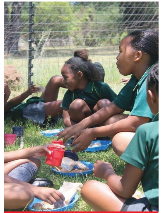
Learners enjoying nutritious and filling meals during breaktime.

This nutrition programme encourages learners to attend and stay in school and lets them focus on learning rather than their stomachs. Good food improves cognitive abilities, so Nokuphila's meals are regularly assessed for nutritional value and portion size to ensure they provide the best food for learning and growing minds.